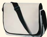
Your Logo printed on bag

Take advantage of an opportunity to have attendees carry your name! Tote Bags are provided for all ISCD Annual Meeting attendees. As a sponsor your name will be printed on the inside flap of the bag along with the ISCD Annual Meeting logo.